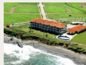
Las Perlas de Gran Pacifica