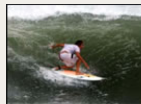
Surfing at Gran Pacifica