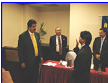
Rotary Oath Ceremony (Click Photo to enlarge)