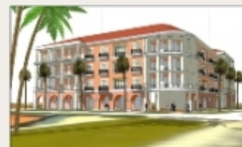
El Coral I Town center Condos